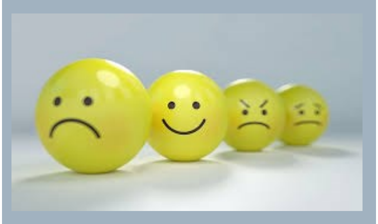
Mental health is important at every stage of life, from childhood and adolescence through adulthood