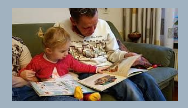
MSUE helps parents and caregivers understand the importance of actively supporting their child's learning.