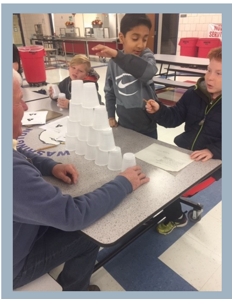
Learning how to code by stacking cups.

https://msu.samaritan.com/custom/502/#/volunteer_home