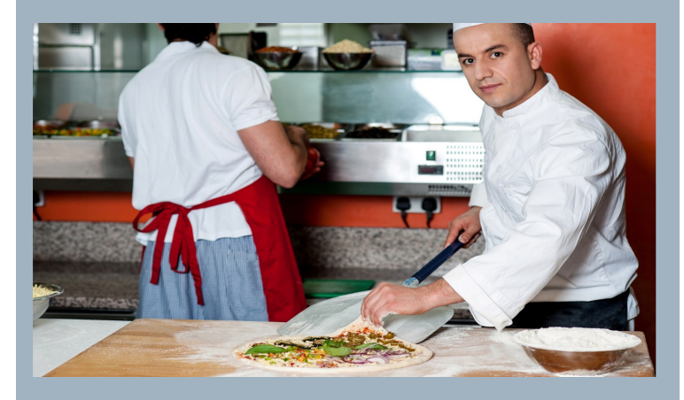
The ServSafe Certification program teaches about foodborne illnesses and how to prevent it.

MSU Extension Social Emotional health programming aims to promote health and wellbeing, including understanding important connections between physical, mental, social and emotional health. In 2019, 10 presentations were held in Bay County, reaching 297 adults and 30 youth. Topics and programs presented included: RELAX: Alternatives to Anger, Stress Less with Mindfulness, Mindfulness for Educators, and Mindfulness for Parents and Caregivers. Special presentations were also held with Families Against Narcotics-Bay Region, the Bay County Prevention Network, and the Bay-Arenac Intermediate School District.