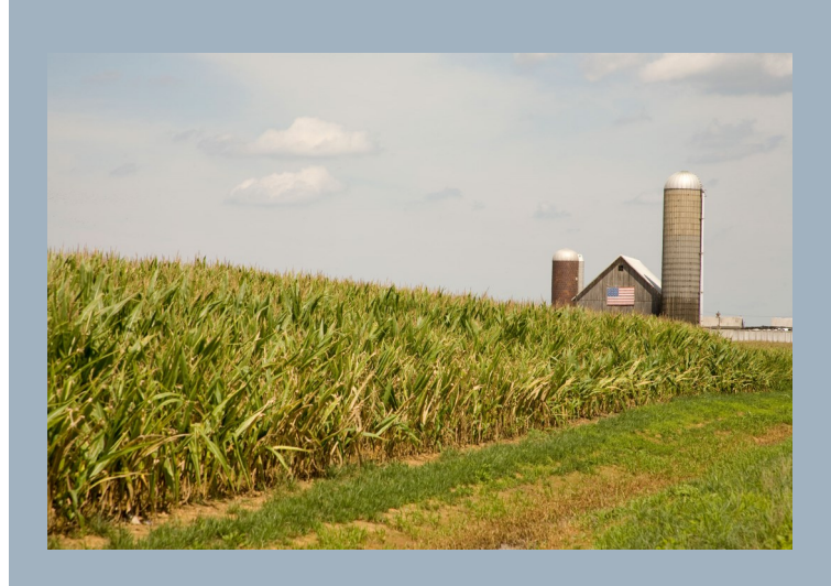
More than 50% of land in Bay County is used as farmland.