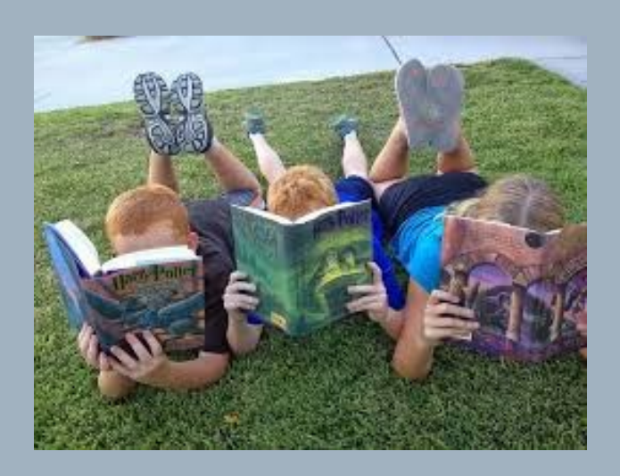
According to the CDC, the first 8 years of a child's life is foundational for his/her lifelong health, learning, and success.

In addition to nutrition education for seniors living in high rises in Bay County, there were 244 senior market fresh coupon books distributed throughout the county. The coupon books were used to purchase locally grown produce.