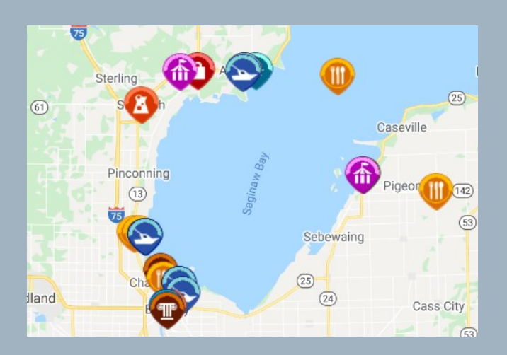
The Great Lakes Fisheries Heritage Trail is an online, mapping tool stakeholders can use to explore fisheries-related places around the Great Lakes. It now features Saginaw Bay opportunities.